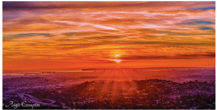
Photo by Angie Crompton taken with Nikon D800, using a Nikon 70-200mm F2.8 zoom lens and processed in Lightroom. Photosjust4you.

To view photographs of the Park captured by each of these photographers, visit the Park website at www.mthelixpark.org or visit their individual web pages listed at the right.