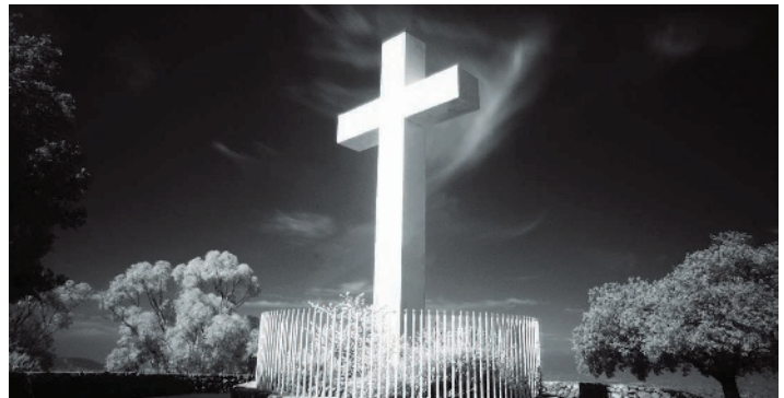
Photo by Gary Junker taken using Nikon D700, Nikkor 24mm f2.0 lens, ISO 250, exposure 20 seconds at f/16, Hoya R72 (Infrared) filter, converted to black and white in Photoshop CS5. www.flickr.com/photos/gpa1001/