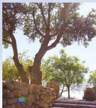
Lemonade berry, an example of a century-old California native plant on Park grounds